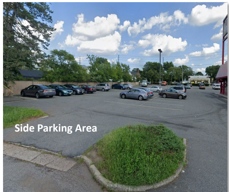
Side Parking Area

The information contained herein has been given to us by the owner of the property or other sources we deem reliable. We have no reason to doubt its accuracy, but we do not guarantee it. All information should be verified prior to purchase or lease.