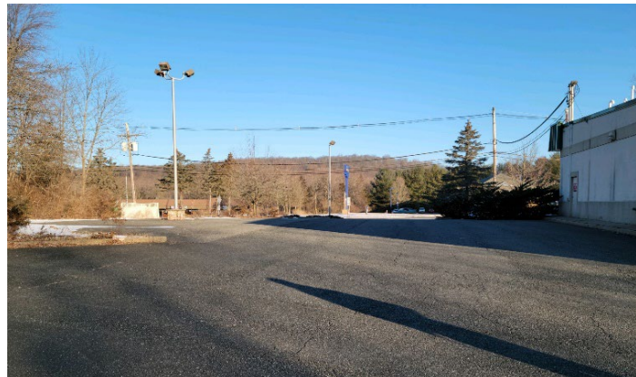
Left Side Corner Parking Lot

For further information please contact Exclusive Broker: