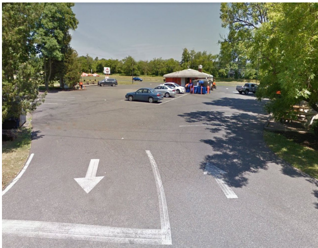
Main Street Entrance