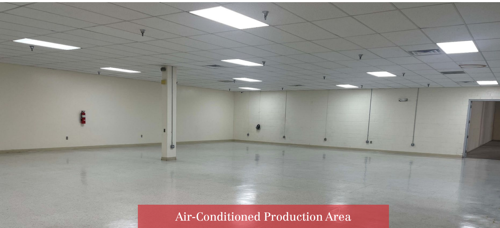
Air-Conditioned Production Area