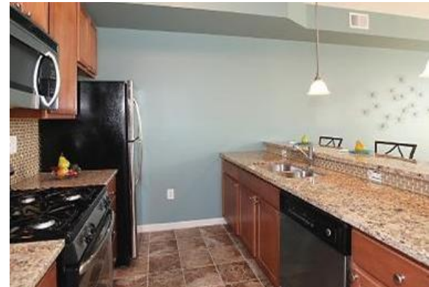
Kitchens feature stainless steel appliances and granite countertops (photo, finishes, and floor plan are of the adjacent 8 unit condo building).

For Further Information Please Contact Exclusive Broker: